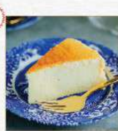
5. JAPANESE CHEESECAKE 5.50 Green Tea, Strawberry, Yuzu