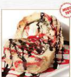
1. TEMPURA ICE CREAM 6.50 Vanilla or Green Tea