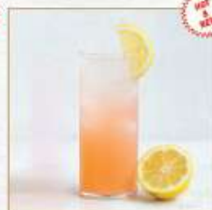
12. PEACH ADE 5.99