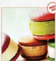
2. MACARON 4.50 Green Tea, Kinako, Strawberry, Mango, Coffee