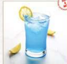
10. BLUE LEMONADE 5.99