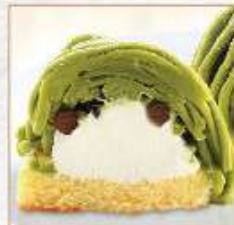
6. MONTBLANC CAKE 7.50 Green Tea