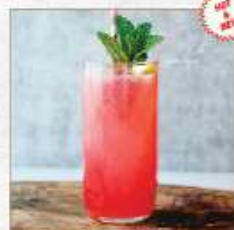
11. STRAWBERRY ADE 5.99