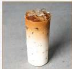
7. K-STYLE COFFEE 7.50