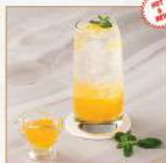
13. YUZU LEMONADE 5.99