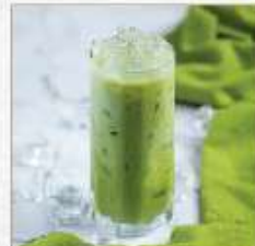
9. ICED GREEN TEA 3.95