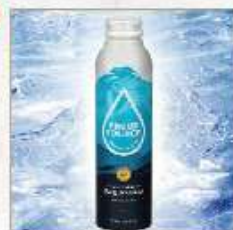
14. PS SPRING WATER 3.95