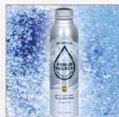
15. PS SPARKLING WATER 3.95