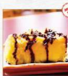
4. TEMPURA CHEESECAKE 7.50