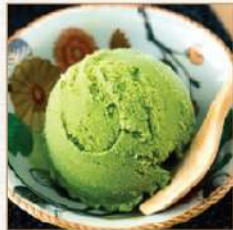
7. ICE CREAM 3.95 Vanilla or Green Tea