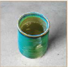
10. HOT GREEN TEA 2.95