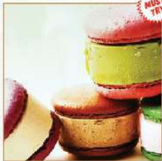
3. MACARON 4.50 Green Tea, Vanilla, Strawberry, Mango, Coffee