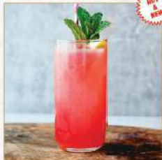
11. STRAWBERRY ADE 5.99