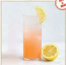
12. PEACH ADE 5.99