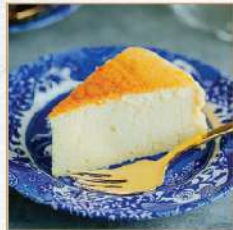
6. JAPANESE CHEESECAKE 5.50 Green Tea, Strawberry, Yuzu