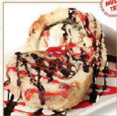
2. TEMPURA ICE CREAM 6.50 Vanilla or Green Tea