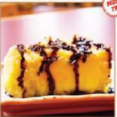
5. TEMPURA CHEESECAKE 7.50