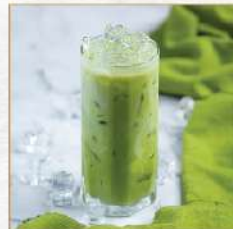
11. ICED GREEN TEA 3.95