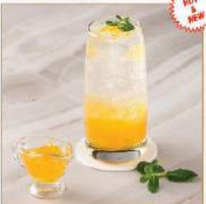
13. YUZU LEMONADE 5.99