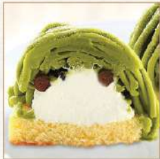
8. MONTBLANC CAKE 7.50 Green Tea