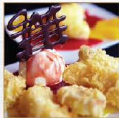
1. BANANA TEMPURA 6.50 Vanilla or Green Tea