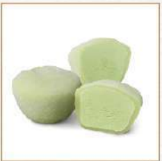
4. MOCHI ICE CREAM 3.50 Vanilla, Green Tea, Strawberry, Mango, Chocolate