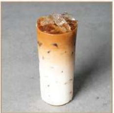
9. KSTYLE COFFEE 7.50