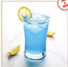
10. BLUE LEMONADE 5.99